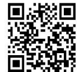
Find support documents, instructional videos, and more at www.hygiena.com