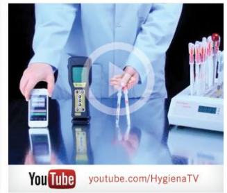
Watch an instructional demo at youtube.com/HygienaTV

MicroSnap Coliform is a rapid test for detection and enumeration of Coliform bacteria. The test uses a novel bioluminogenic reaction that generates light when enzymes that are characteristic of Coliform bacteria react with specialized substrates. The light generating signal is then quantified in the EnSURE luminometer. Results are available in 8 hours or less, depending upon required level of detection. Single figure organisms can be detected in 8 hours, delivering results in the same working day or shift.